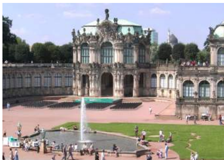
The Dresden Zwinger