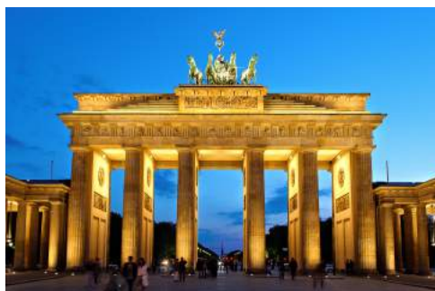
Brandenburg Gate, Berlin