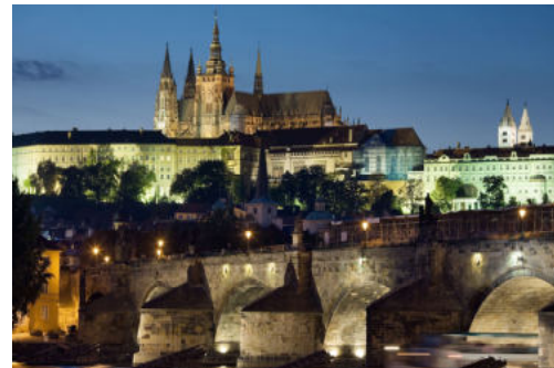
Prague Castle & Charles Bridge, Prague