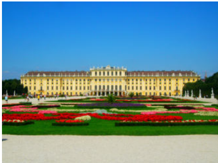
Schoenbrunn Palace, Vienna